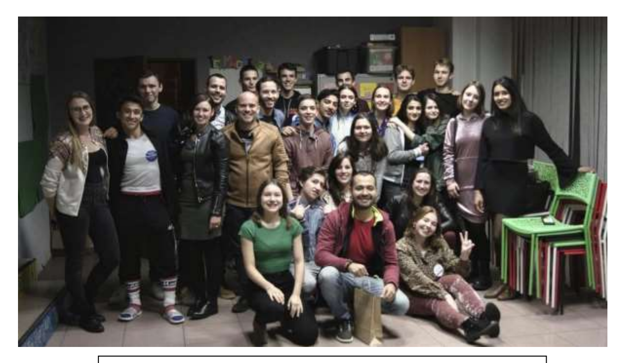
This is all the voluunters with our mentors during the welcome party